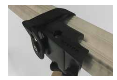
Fig. 3. Fig. 4. Fig. 5.