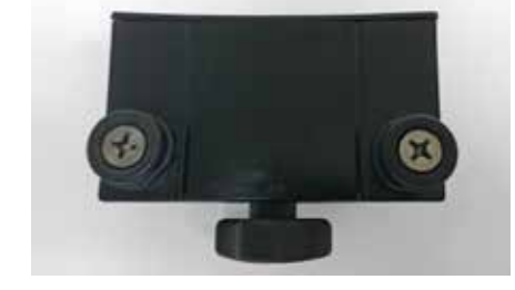
Fig. 1. Fig. 2.